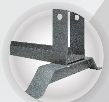
Well-Designed Legs with Bolt Holes