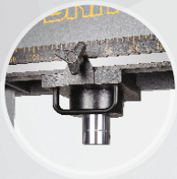
Scale & Sliding Cylinder with Handle and Rotatable Knob