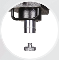
Quick Detachable Top Cover