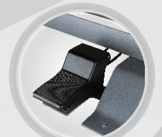
Pneumatic Foot Pedal Switch