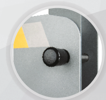
Working Bench Pin with Plastic Sleeve at One End