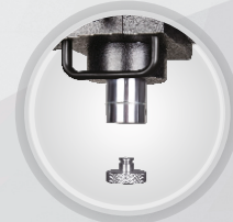
Quick Detachable Top Cover