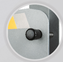
Working Bench Pin with Plastic Sleeve at One End