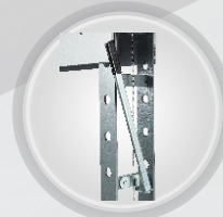
Handle Assy Holder