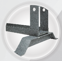
Well-Designed Legs with Bolt Holes