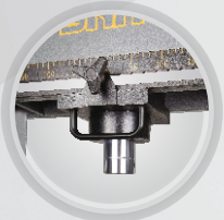
Scale & Sliding Cylinder with Handle and Rotatable Knob