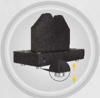
V-block & Up-down Moveable Pins