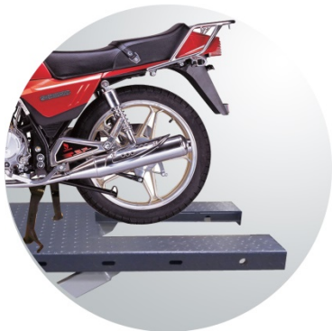
* removable cover under the rear wheel

The MC600 lift is an electro-hydraulic motorcycle lift designed for servicing motorcycles, scooters and ATVs. It is equipped with a mechanical front wheel holder. As an option, it can be extended to ATVs and CUSTOM motorcycles.