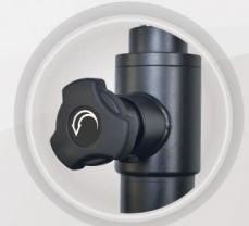
Relief knob with two speeds action