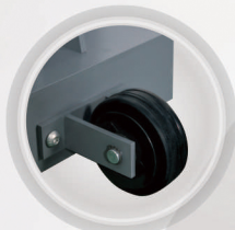
Easy moving when folded