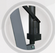
Double pumps and 200° rotatable cylinder assy