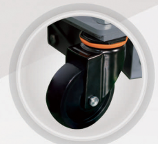
Nylon wheel with fiber glass