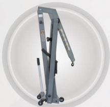
Small space when folded