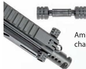
Ambidextrous charging handle