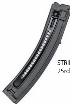
STRIBOG TR22 25rds