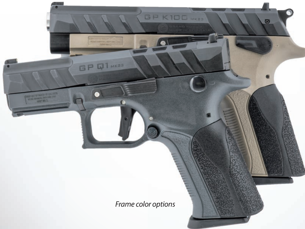
Frame color options