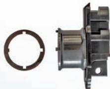
AR-type stock adapter