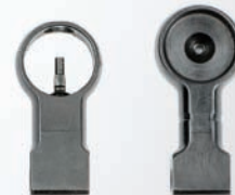
Set of steel sights