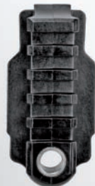
Picatinny QD backplate